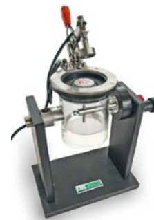
ENR-Crown Crown Attachment