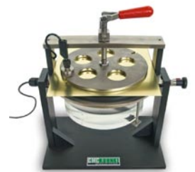
ENR-Sheet Flat Sheet Attachment